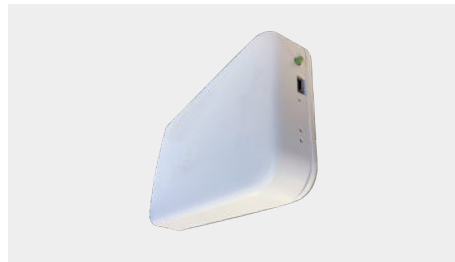
Wall Mount Version